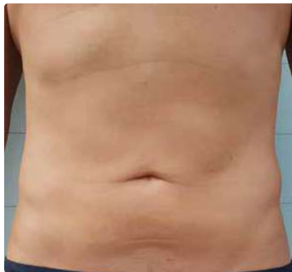
30 days after the 3 rd treatment

Patient with skin laxity problems in the abdominal area close to the navel, despite his intense sports activity and good muscular tone.