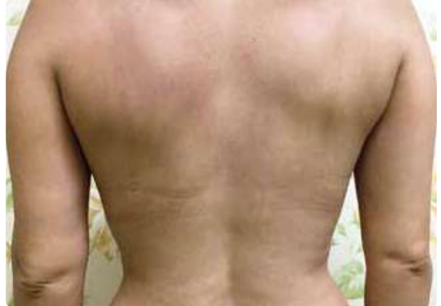
90 days after 1 single session