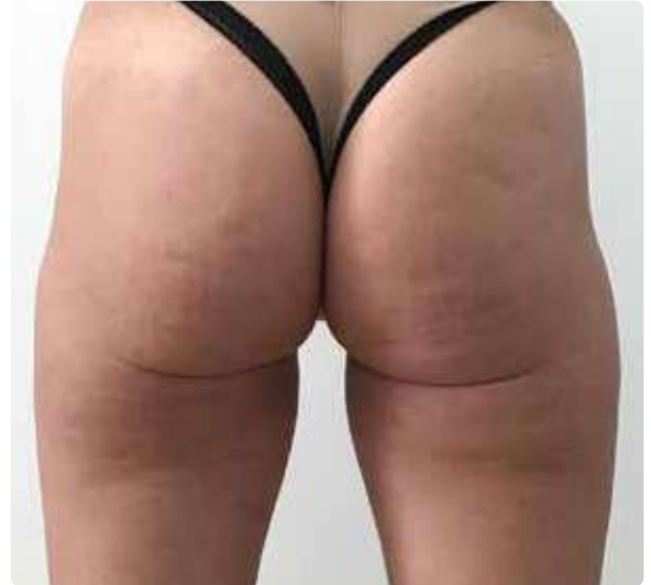
30 days after 1 single session