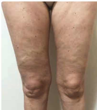
Follow-up after the 1 st session.