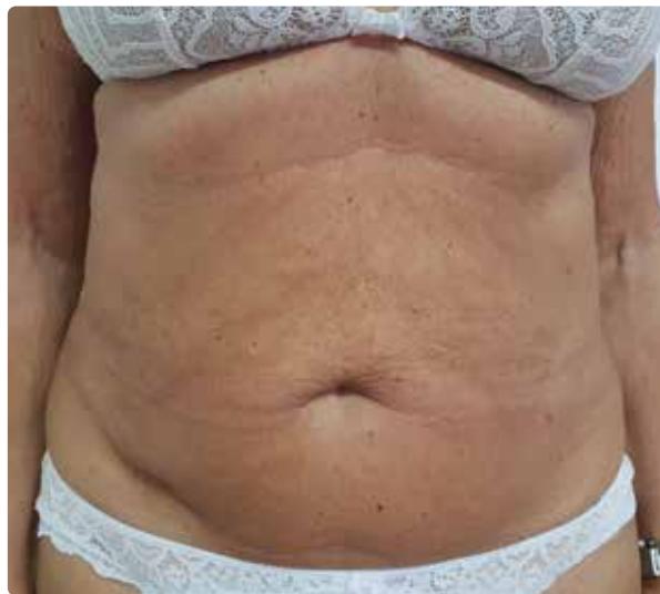
60 days after 1 single session