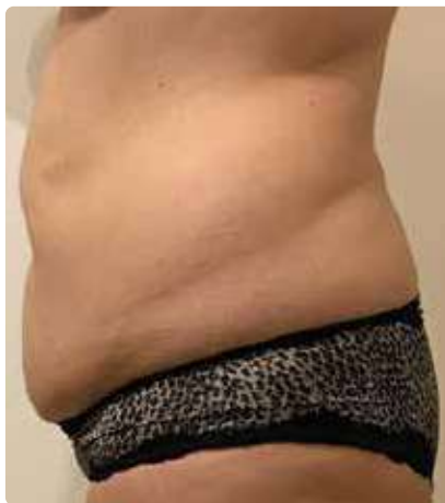
Follow-up after the 2 nd session