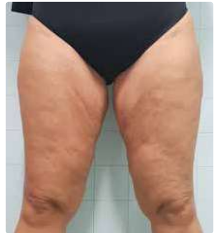
60 days after 1 single session