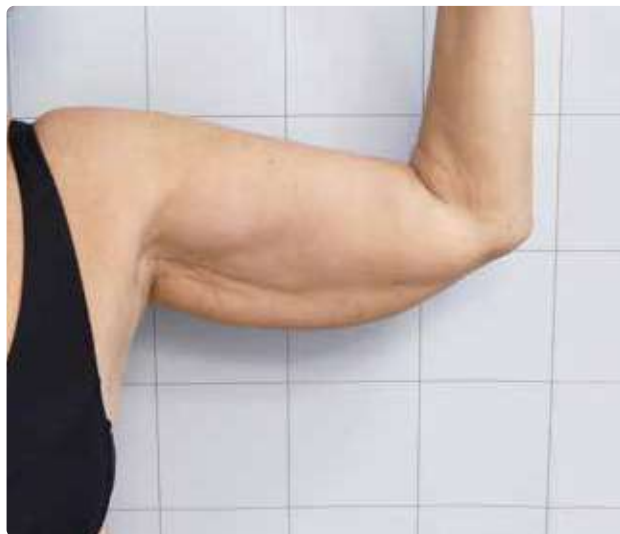
Follow-up after the 3 rd session