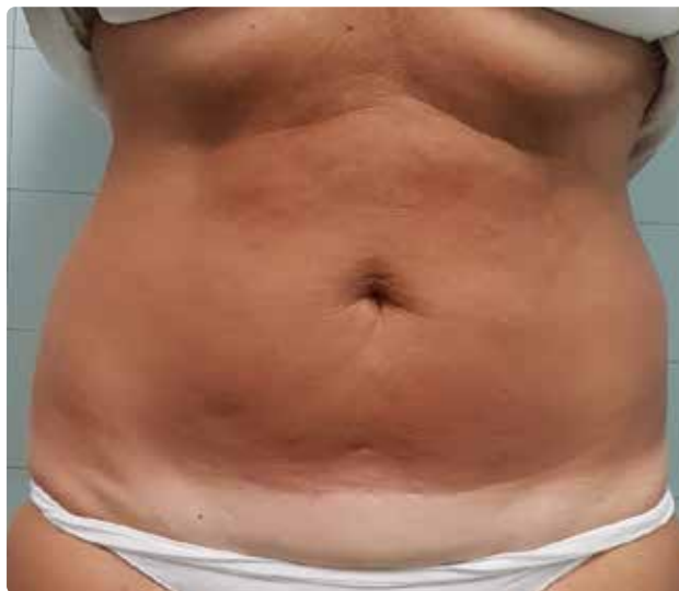
45 days after 1 single session