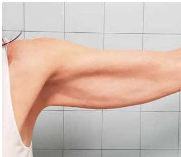
30 days after the 3 rd treatment