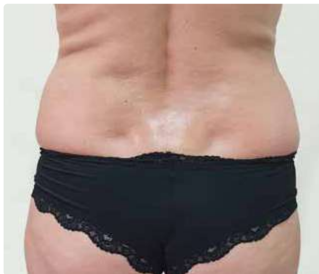
30 days after the 2 nd session