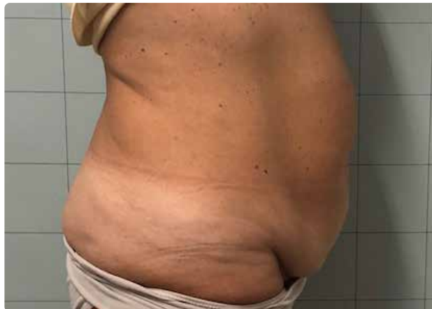
30 days after the 3 rd treatment