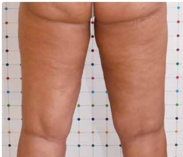
Follow-up after the 3 rd session