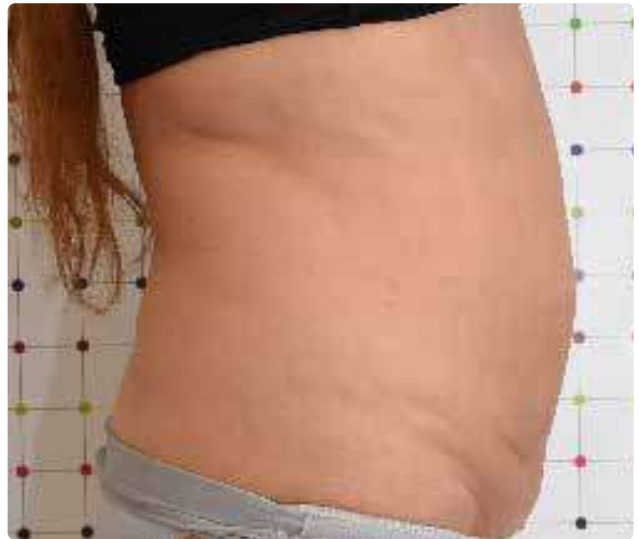
45 days after 1 single session