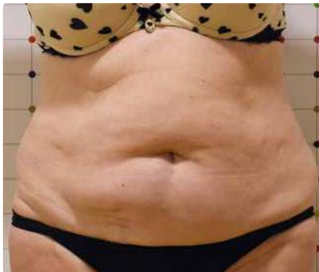
30 days after the 2 nd session

Waist reduction: 10 cm for the high abdomen and 5 cm for the lower abdomen