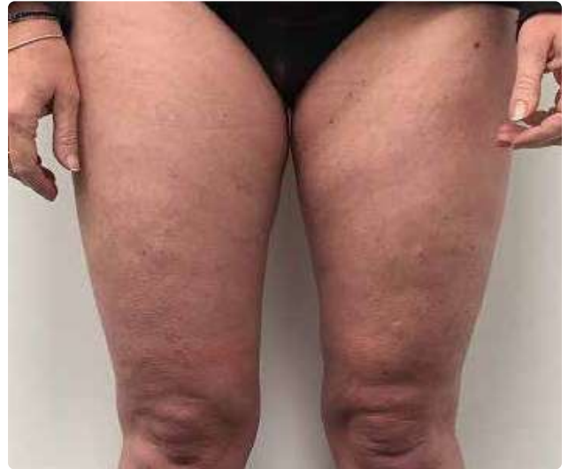
Follow-up after the 2 nd session