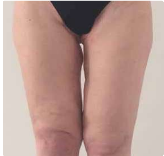
Follow-up after the 3 rd session