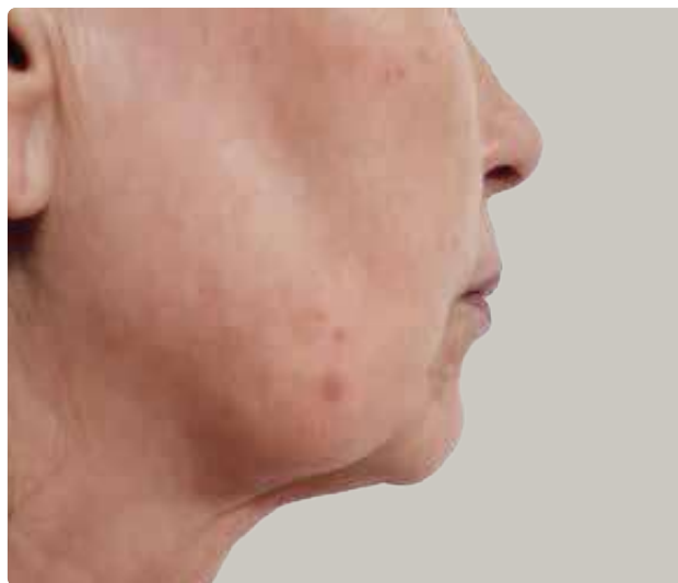
After 4 sessions