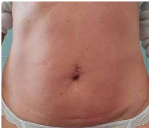
30 days after the 4 th treatment