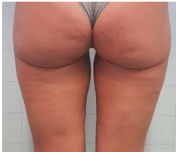
30 days after 1 single session