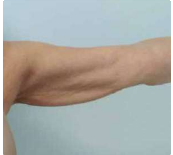
Follow-up after the 2 nd session