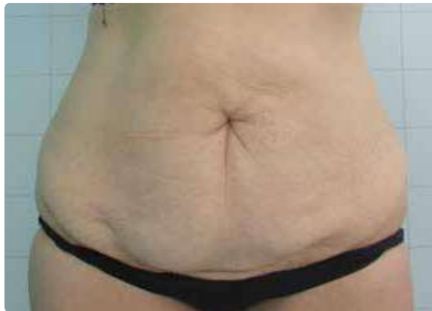
Follow-up after the 2 nd session