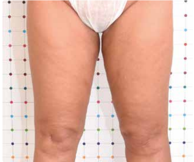
Follow-up after the 3 rd session