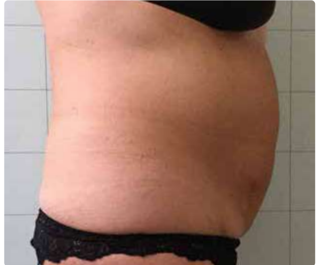
30 days after the 3 rd treatment