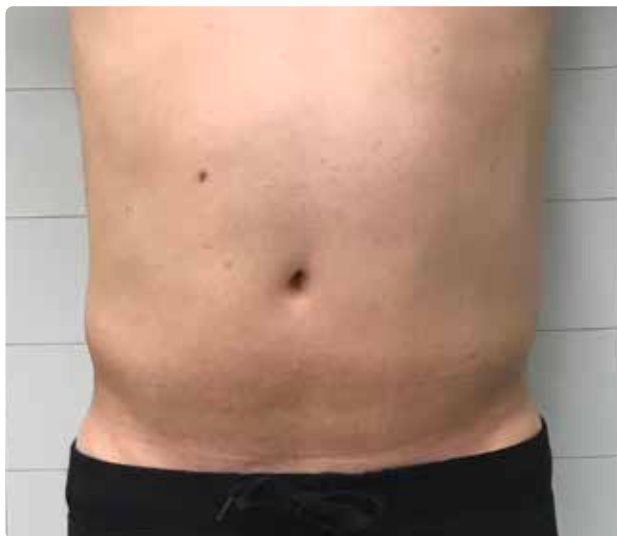
35 days after the 2 nd session