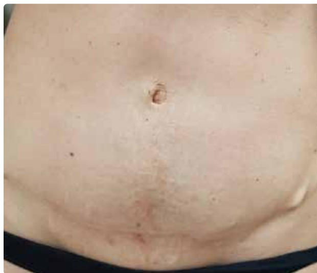
30 days after 1 single session

The patient had an important flabbiness problem due to two pregnancies with quite "big babies". She had already tried other procedures before Onda without significant results.