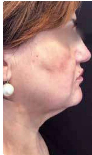
After 3 sessions