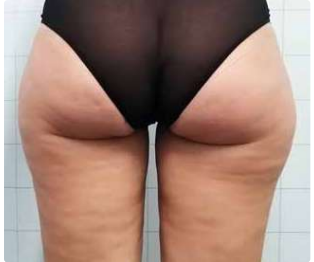
30 days after the 4 th treatment