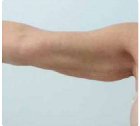
Follow-up after the 2 nd session