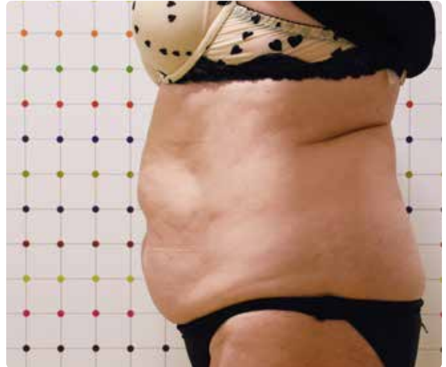
30 days after the 2 nd session

Waist reduction: 10 cm for the high abdomen and 5 cm for the lower abdomen