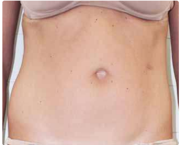
35 days after the 2 nd session