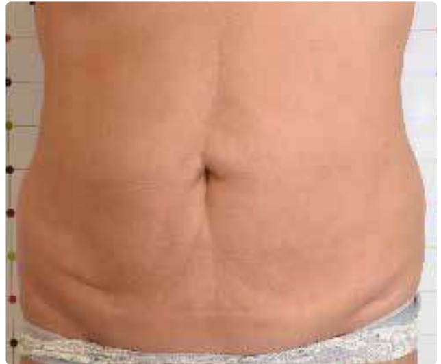
45 days after 1 single session