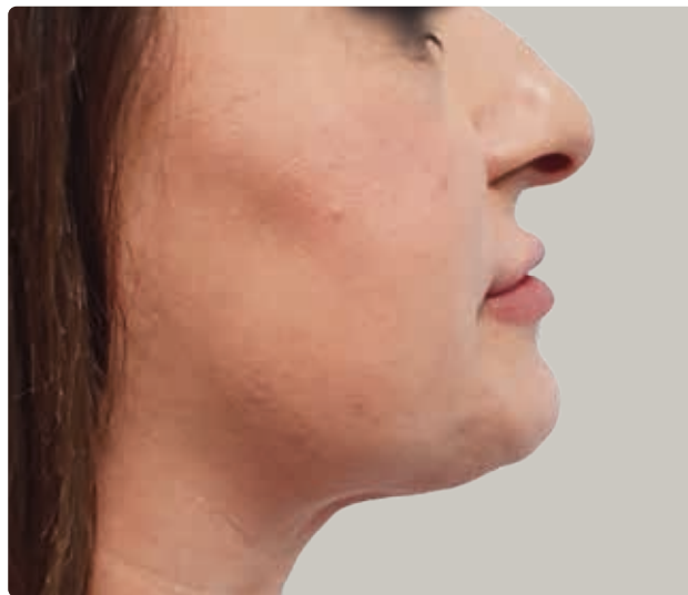
After 4 sessions