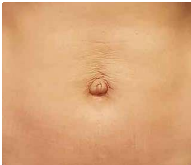
30 days after the 3 rd treatment