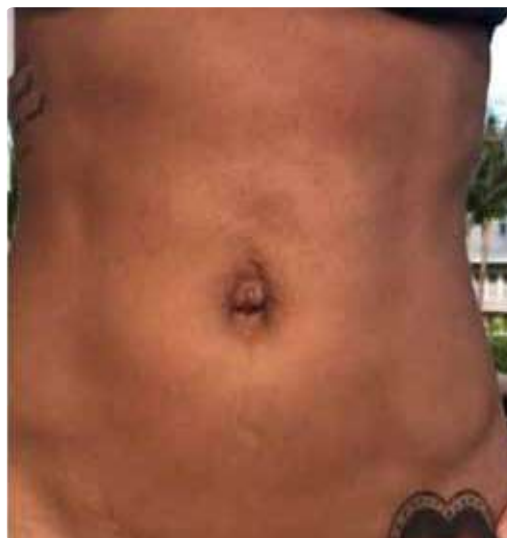
60 days after 1 single session