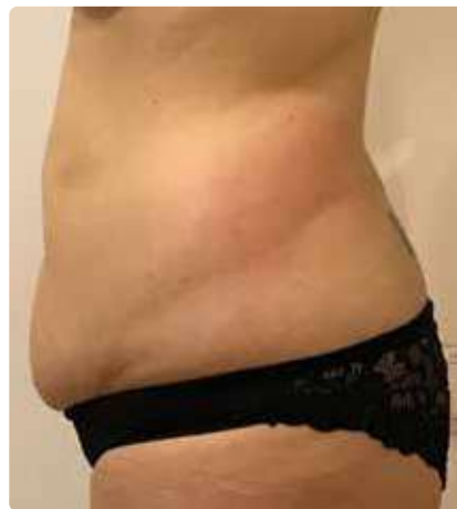
Follow-up after the 3 rd session

Courtesy of Ciprian Constantin Flueraș, M.D. - C Beauty anti-aging clinic, Brasov - Romania