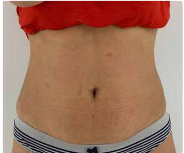
15 days after 1 single session