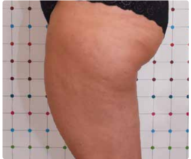
Follow-up after the 4 th session