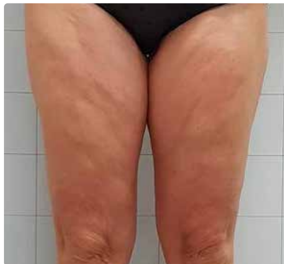
60 days after the 2 nd treatment