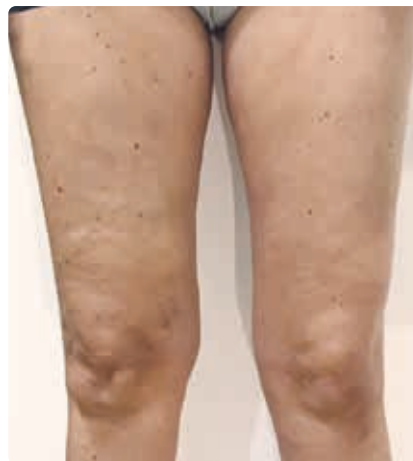
Follow-up after the 2 nd session.