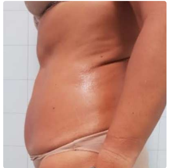
30 days after 1 single session